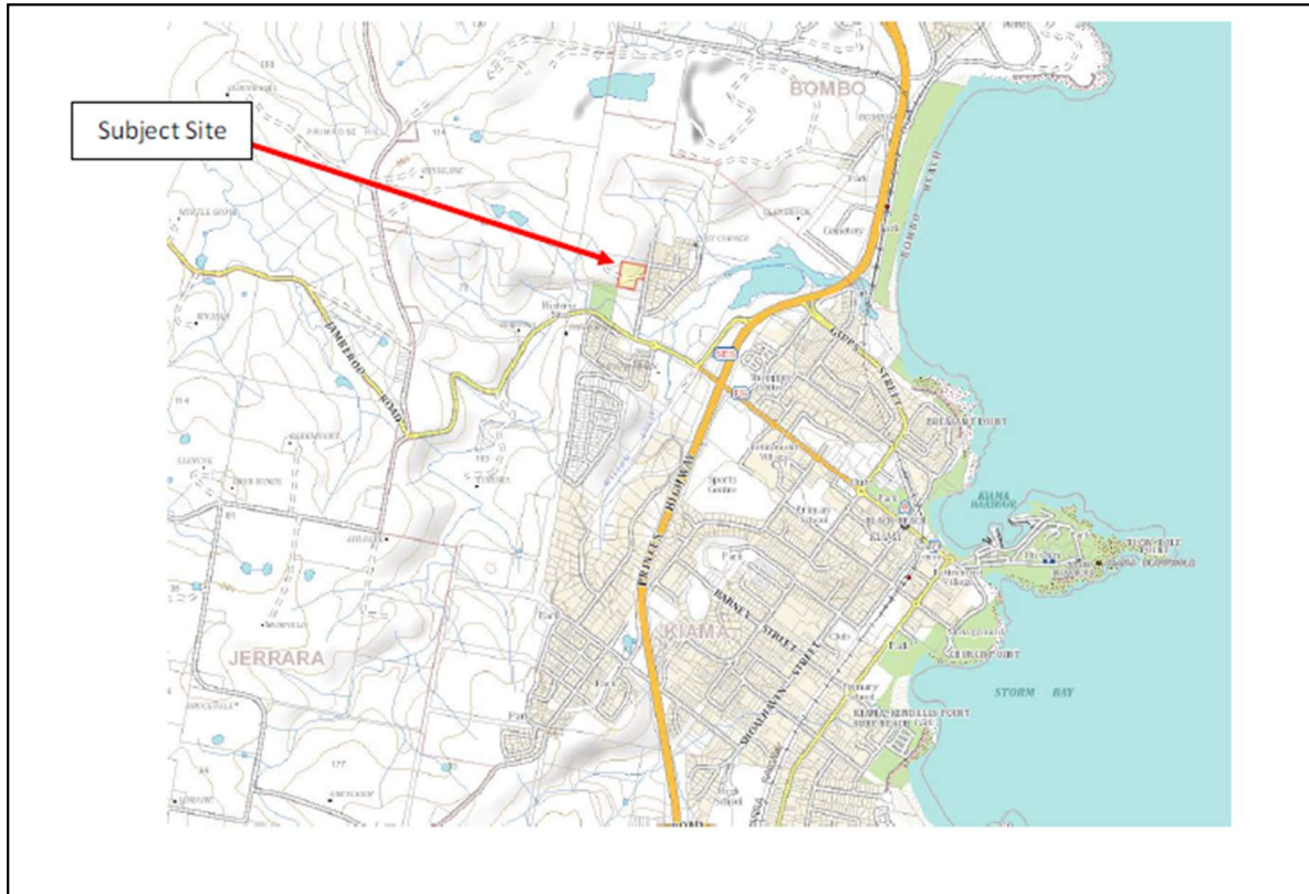
Subject site and locality plan